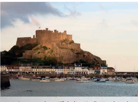
Jersey - a beautiful place to live and work